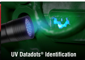
UV Datadots® Identification

To find your nearest dealer visit: www.cesarscheme.org/dealer.php