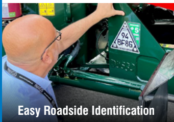
Easy Roadside Identification

*compared with statistics produced by IMIA **source PANIU