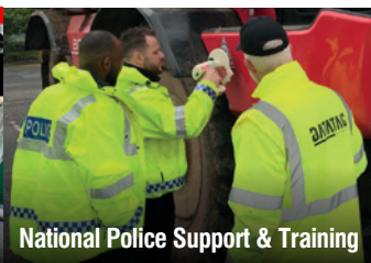
National Police Support & Training