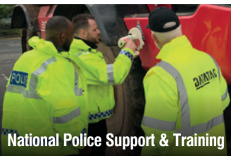
National Police Support & Training