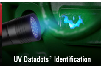
UV Datadots® Identification