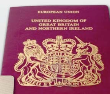
Photo identification is an obvious starter for ten, but is only any good if presented to you by the person in the photo!!!!! Do not accept anything sent electronically via fax or email. It is the easiest thing in the world to obtain a stolen or fake driving licence or passport, which can then be used by the criminals to exploit your business.

A number of cases have recently been brought to the attention of PANIU concerning plant hire scams. We are unable to disclose specifics at this time due to ongoing investigations. However if your plant hire business wants to protect itself from becoming the next victim ensure your standard operating procedures for hiring out plant are robust and up to date.